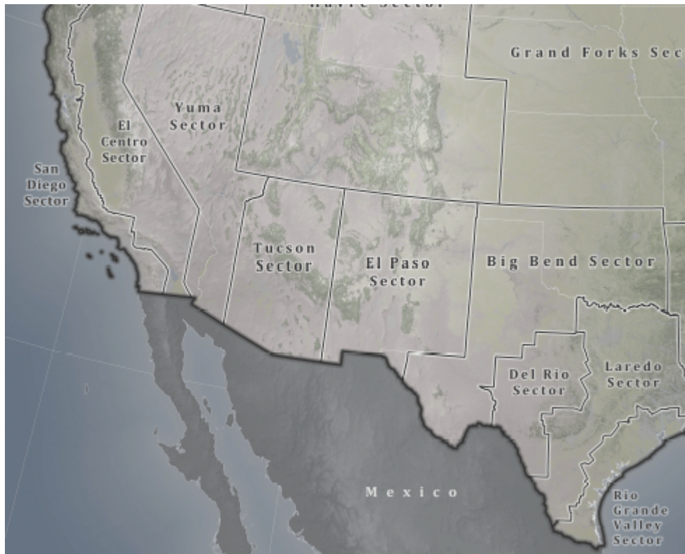
Figure 2. Map of southwest border sectors